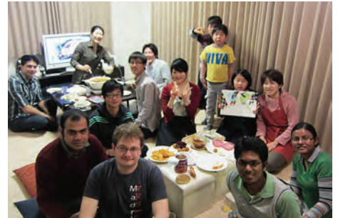
Host Family Program