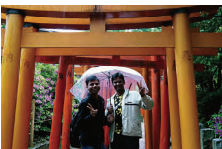
JLC - Excursion to Nezu Shrine