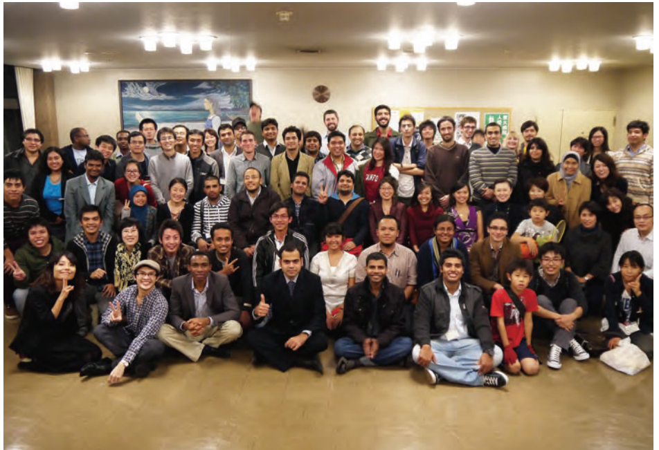
Welcome Party organized by ISACE (The International Students' Association in Civil Engineering)