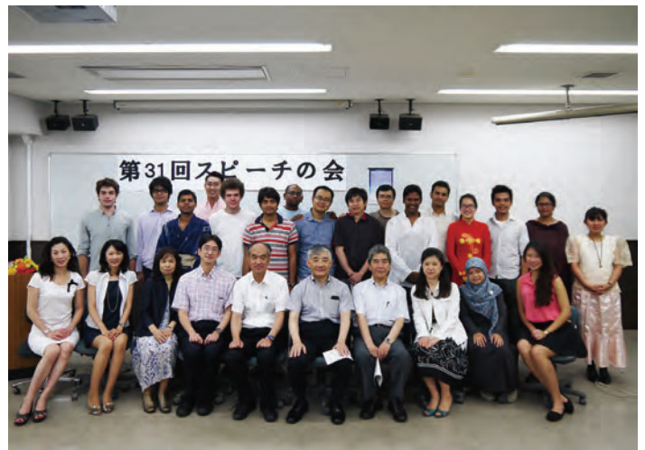
JLC - Speech Contest