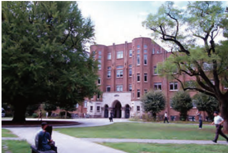
Civil Engineering Building

gives you opportunities to gather with a Japanese host family to learn more about Japanese culture.