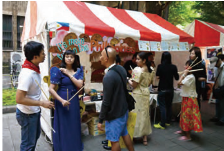
May Festival at Hongo Campus