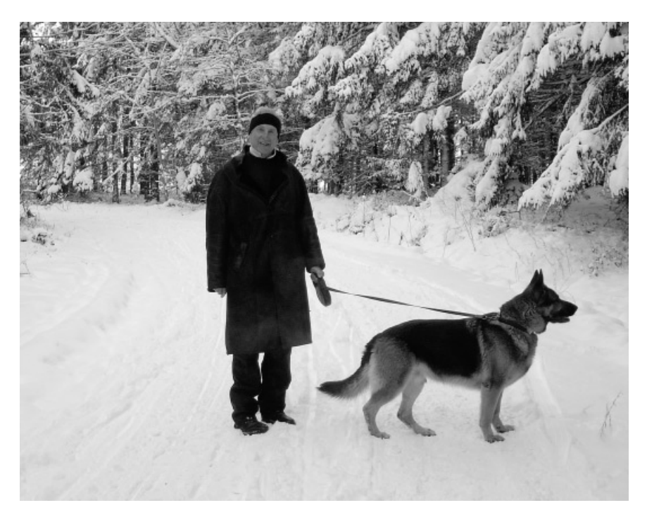
Master and dog (or vice versa?).

I had come to Vienna in 1978 with great hopes. At the end of the 1960s and in the 1970s there was quite some optimism in Austria (and also in Germany) that it would be possible to close the gap to the leading institutions worldwide. For a number of reasons this did not happen, however. One reason is that in the 1970s the so-called process of democratization of universities was given priority over efficiency in research. There is no simple answer to the question of why I stayed on in Vienna and did not move to Munich. A partial answer perhaps is that Austria is a beautiful country and that the quality of life (outside of the academic sector) is high. Furthermore, the situation at the School of Math-