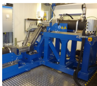
Unique test stand at TU Wien

Freewheel clutches have proven to be very sensitive transmission components. TU Wien has compiled and analysed the information available on details of mechanical components, operational experience and reported incidents involving freewheel clutches.