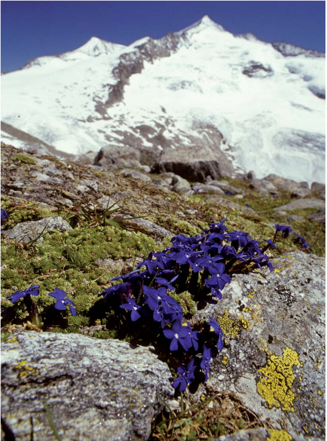
Spring Gentian with a view to the Groß- and Kleinvenediger in the Hohe Tauern National Park