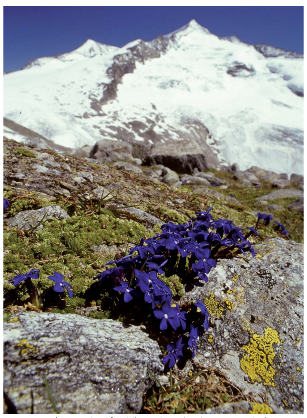
Spring Gentian with a view to the Groß- and Kleinvenediger in the Hohe Tauern National Park