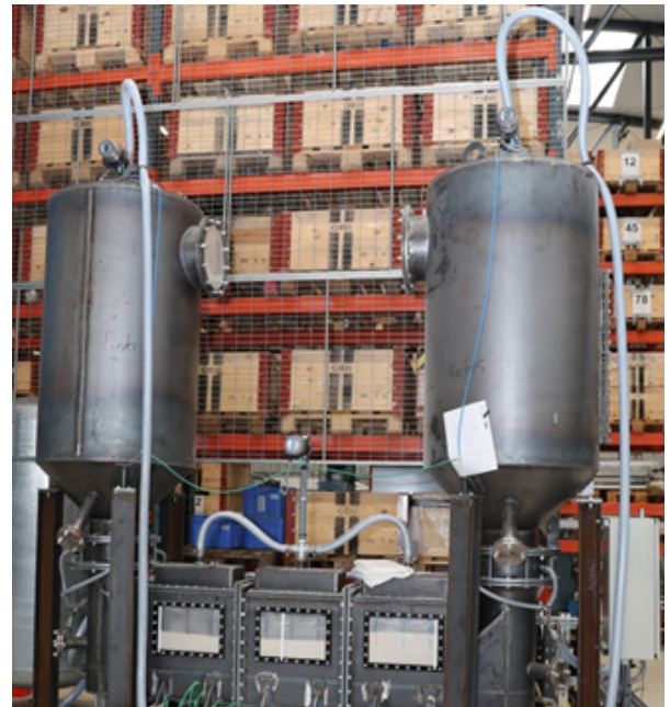
FP-TES pilot plant at TU Wien

The aim of the research work at the Institute of Energy Systems and Thermodynamics (IET) of TU Wien was to minimize the number of components necessary for the transport of the storage material and to realize a separation of the heat output from the storage capacity. In addition, the storage solution should be compact, technically easy to handle and economical. Other aims were good environmental compatibility, operating pressure of the system in (near) ambient conditions, and a temperature range between 300 °C and 800 °C.