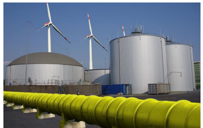
Part of the future of energy: green energy stored in gas