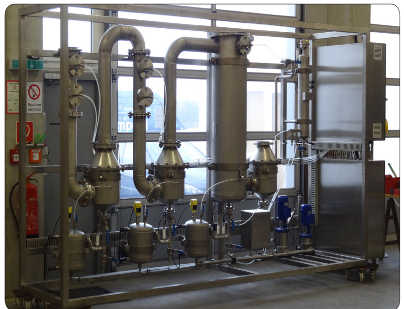
Three-stage desulphurisation system for 500m 3 /h biogas with 99% separation efficiency for H_2S

The approach is based on a chemical washing process, in which biogas is intensively exposed to a concentrated alkali hydroxide solution, for example sodium hydroxide, in a washing apparatus. The selectivity between the absorption of hydrogen sulphide and carbon dioxide is achieved by keeping the contact time as short as possible and preferably using the favourable absorption kinetics for the separation of the hydrogen sulphide. The two-phase gas/washing agent mixture then immediately undergoes a phase separation, in which the gas is freed of fluid. The separated washing solution is subsequently subjected to oxidation with hydrogen peroxide in a separate reactor to that of the gas phase. The reaction yields a non-toxic, aqueous sodium sulphate solution and can, for example, be fed to the biogas fermenter or the discharge system.