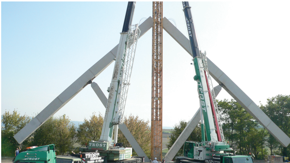
Fig. 1 Construction of the prototype Click here to watch the video

This new bridge construction method consists in building the bridge girders in a vertical position and in rotating the bridge girders into the final horizontal position. The span of the bridge girders is reduced by the compression struts, which enables considerable savings in construction materials.