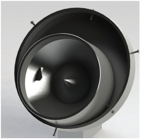
Figure 1: Special shaped inner vessel in a bigger rotating vessel

Magnetron sputtering is one of the most widely used methods for thin film deposition. It can be utilized to manufacture nearly every metal coating or metal composite as well as nitride, oxide, carbide, fluoride and arsenide layers with controlled stoichiometry, thus making magnetron sputtering a most versatile coating method. The possibility to coat large area substrates and the easy-to-handle process parameters of magnetron sputtering enable a wide range of industrial applications.