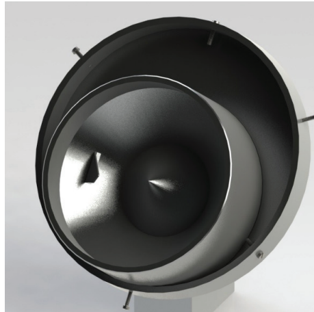
Figure 1: Special shaped inner vessel in a bigger rotating vessel

Magnetron sputtering is one of the most widely used methods for thin film deposition. It can be utilized to manufacture nearly every metal coating or metal composite as well as nitride, oxide, carbide, fluoride and arsenide layers with controlled stoichiometry, thus making magnetron sputtering a most versatile coating method. The possibility to coat large area substrates and the easy-to-handle process parameters of magnetron sputtering enable a wide range of industrial applications.