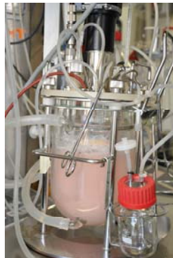
Culture of halophiles in a corrosion resistant bioreactor

The technology relies on halophilic microorganisms for the recycling of waste streams. Halophilic microorganisms are capable of growing on a wide variety of carbon sources. They are reported to grow on different organic acids, diverse sugars, the sugar alcohol glycerol and even aromatic compounds, among others. In addition they are producing secondary metabolites like carotinoids or bioplastics and they could even be used for the production of recombinant products. The technology deals with defined medium and - as salt have to be added to the waste stream - with a corrosion resistant bioreactor.