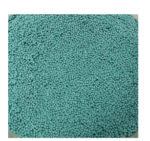
Figure 2: CuSO<sub>4</sub> on zeolithe