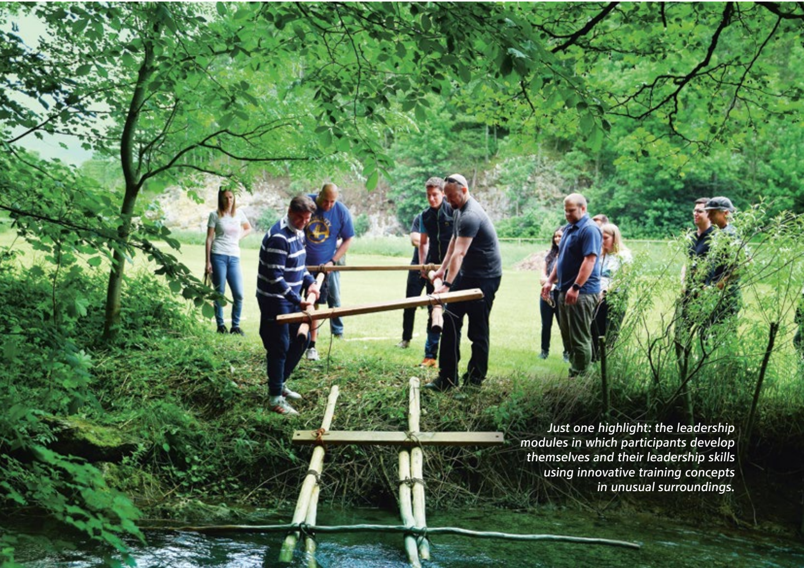
Just one highlight: the leadership modules in which participants develop themselves and their leadership skills using innovative training concepts in unusual surroundings.