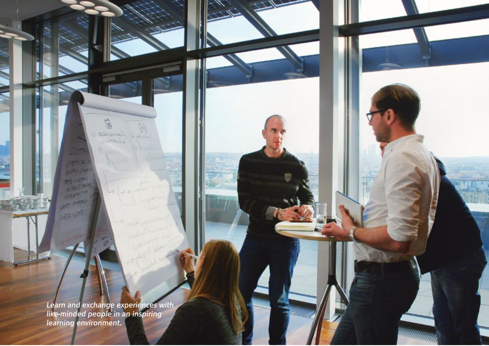
Learn and exchange experiences with like-minded people in an inspiring learning environment.